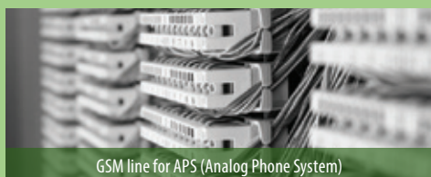
GSM line for APS (Analog Phone System)