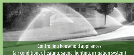
Controlling household appliances (air conditioner, heating, sauna, lighting, irrigation system)

AJS Anti-Jammer System: the product can detect GSM jammers; Bluetooth: the product can be programmed using Bluetooth connection; 48/72 V: the module can simulate telephone line; 3 years warranty: the product comes with 3 years manufacturer warranty; Voice menu: the module can be programmed with human-voice menu system with the use of phone buttons; Plug&Play: the module can be easily installed, no need of programming; ProRead: professional programming software to program the module via PC with USB or Bluetooth connection; AndroRead: Android based application to program and control our GSM modules via Bluetooth connection; Dual Memory: settings are stored at two places on the module