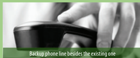
Backup phone line besides the existing one