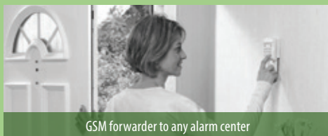
GSM forwarder to any alarm center