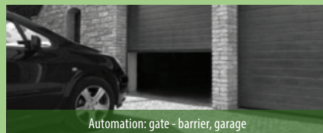
Automation: gate – barrier, garage